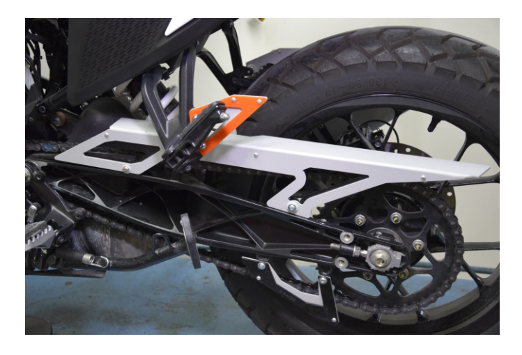
We wish you many and good kilometers! Thank you for choosing one of our products.

It only protects the chain and you from the grease which has. It does not protect the shock absorber and its surrounding area from mud, water, and soil.