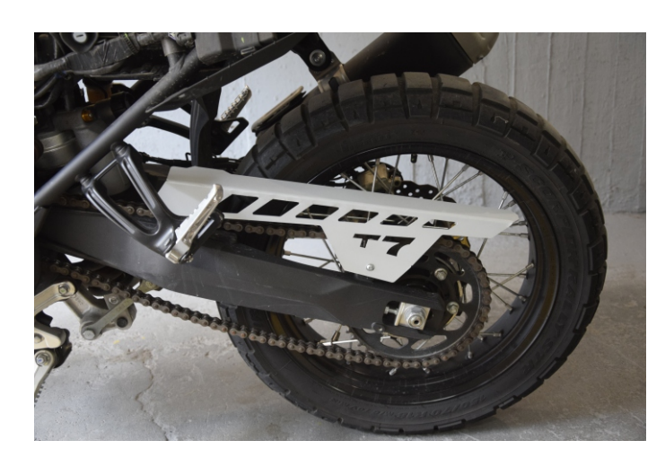
This will be your final result. Enjoy your rides!