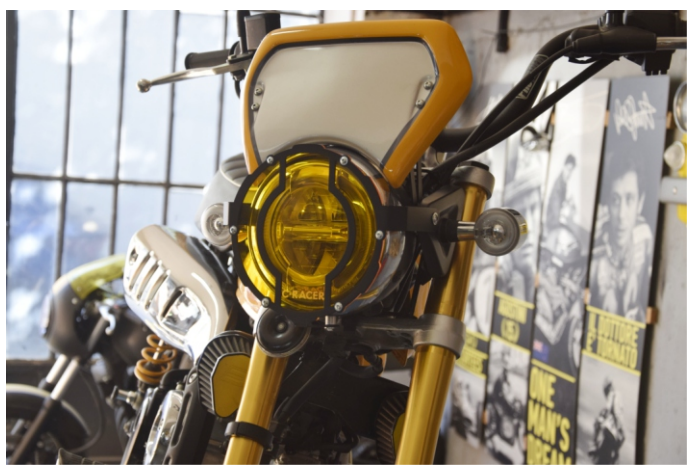
This will be your final result. Enjoy your rides!